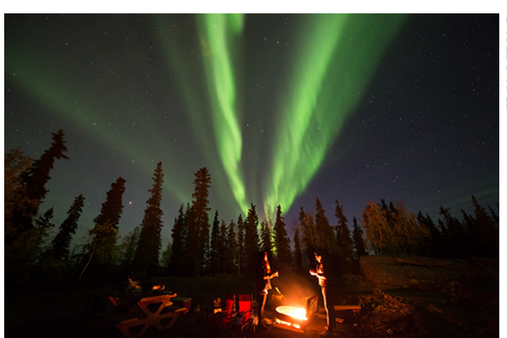
Enjoy the ethereal beauty of the Northern Lights over the Canadian boreal forest!

For tour dates, rates, and additional information visit jfsalgado.com.