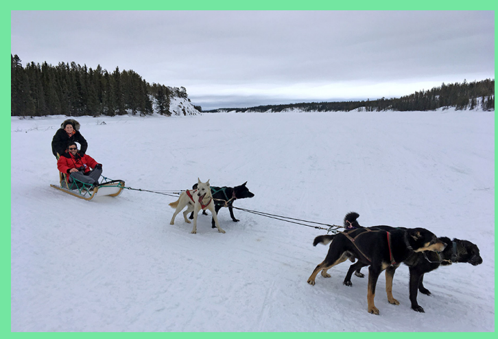
Drive your own dog team on a frozen lake and enjoy winter nature at its best