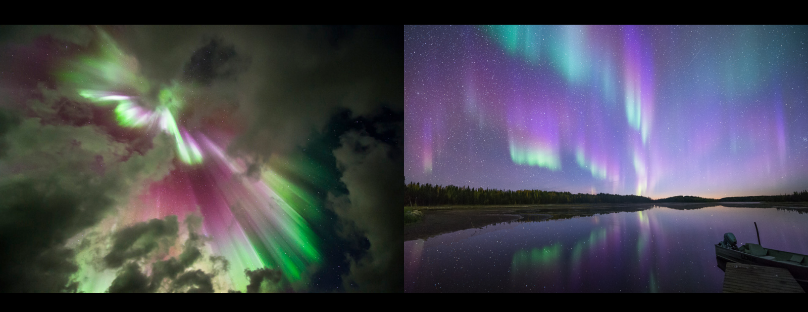
The tour fulfilled a bucket list wish for us. The Northern Lights were even more awe inspiring than we had hoped. Being scientifically curious, we found José Francisco's teachings fascinating. We are hoping for future trips with Borealis Science & Photo Tours. — Colleen and Steve McClure

In September we drive deep into the enchanting boreal forest to see the reflection of the Northern Lights dance across the water on some of Yellowknife's many beautiful lakes.