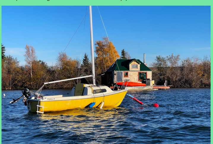
Enjoy a boat tour of Yellowknife Bay anc its picturesque house boats.