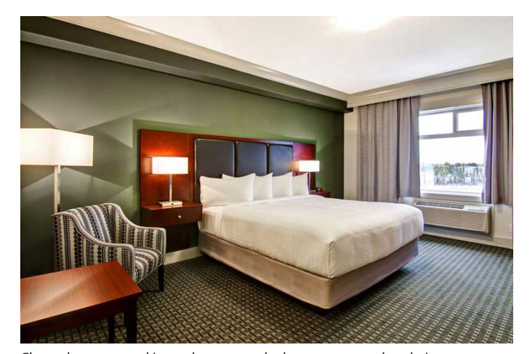
Choose between one-king and two-queen bedrooms among other choices.

Auroras are visible from Yellowknife almost every night as long as the skies are clear. In case of cloudy nights, we have designed our tours to be six nights long to maximize the probability of seeing the Northern Lights. We have also planned daytime activities to take advantage of the wonderful things Yellowknife has to offer.